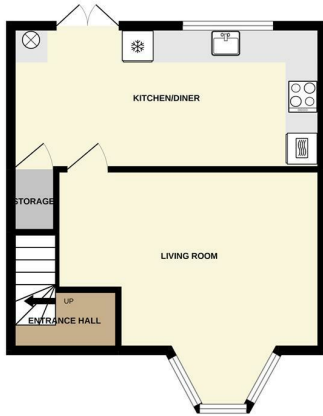
GROUND FLOOR 403 sq.ft. (37.4 sq.m.) approx.